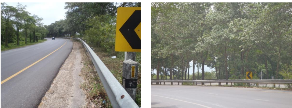
Fig. 3. Guard rails were installed to protect errant vehicles from impacting trees.

Strategy 5: Reduce the severity of crash impact for the occupants of errant vehicles [20].