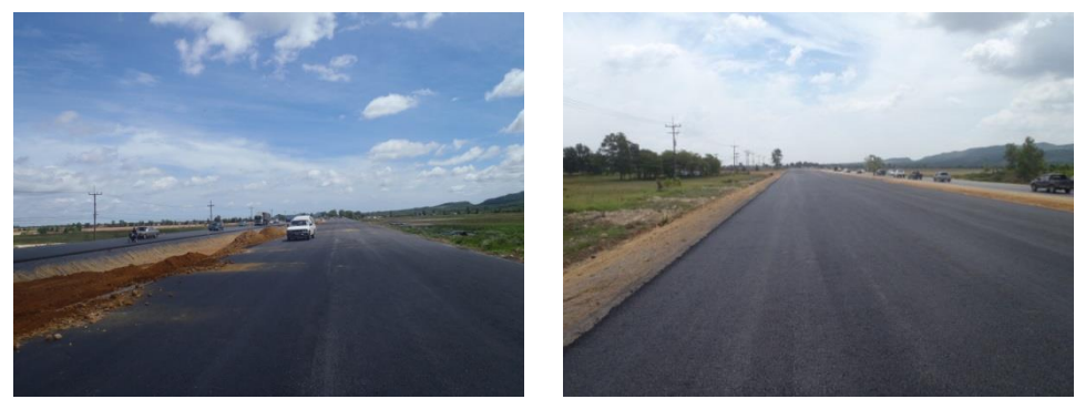
Fig. 5. Improvement in roadside safety after treatment of median by removal of trees.