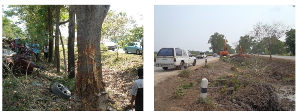
Fig. 4. Roadside crash in the median where trees were hit and safety improvement made during reconstruction and existing trees in the median removed.