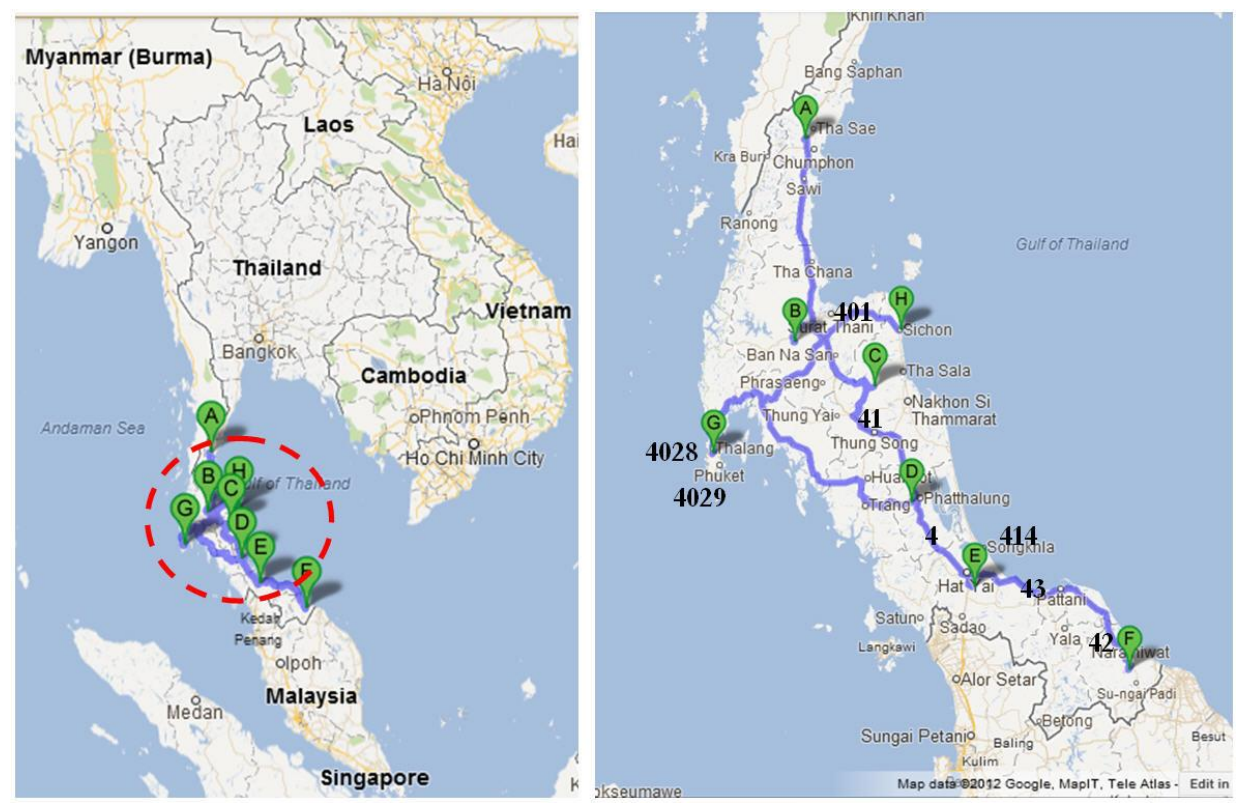
Fig. 2. Location of the roadside crashes on 8 national highway sections.

Summary of findings of the investigated roadside crashes are given in Tables 2 and 3. It is seen that out of the total 21 cases, 18 involve fatalities, while 3 involve serious injuries. The consequences of these crashes result in 63 fatalities, 85 serious injuries, and 142 slight injuries. The causes of these crashes are presented in Table 3. They are categorized into three main contributing factors, i.e. human errors, vehicle defects, and road and environment defects.